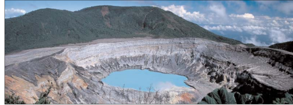
Workaholics can chill out in Costa Rica. Find out more on page 12

"Great Reading—Without the Ink Smudges & Paper Cuts!"