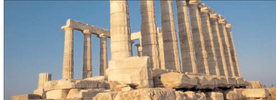
Find out where to buy your tickets to the 'Big Fat Greek Olympics' on page 11.