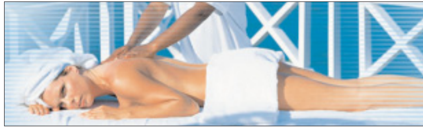
Give yourself a (spa) break: Find some that won't break the bank on page 10.

"Great Reading—Without the Ink Smudges & Paper Cuts!"