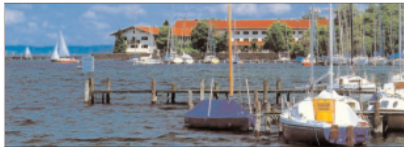
Yankee Doodle Dandy vacations—and deals for military families—on page 9.

"Great Reading—Without the Ink Smudges & Paper Cuts!"