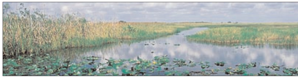
Everglades Escape: Spring break isn't just for students. Check out our deals on page 8.

"Great Reading—Without the Ink Smudges & Paper Cuts!"