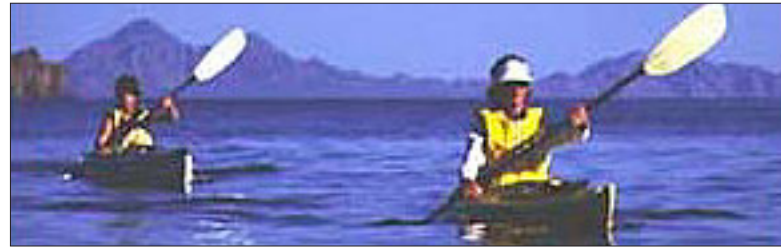
Baja will cure your winter blues. Learn how on page 10.

"Great Reading—Without the Ink Smudges & Paper Cuts!"