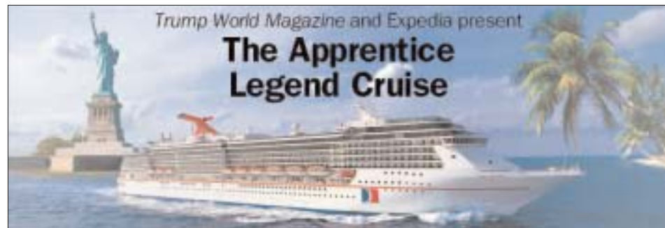
Find spring price breaks and fall fun on the high seas on page 14.