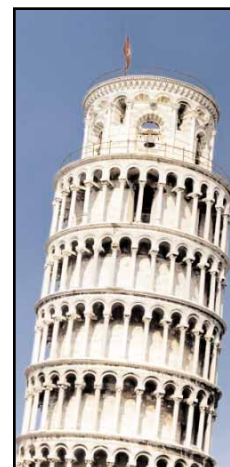
Still Leaning: The Tower of Pisa.

I've been able to afford these trips thanks to careful planning and the good fortune of having friends and relatives who