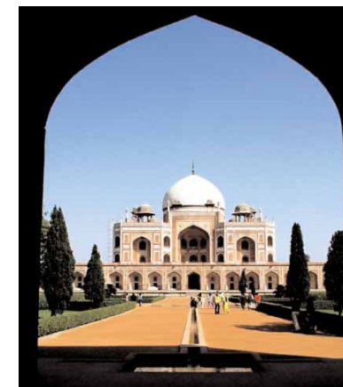
Humayun's Tomb, New Delhi.

India's probably off the map for many Americans who get a measly 10 days of vacation per year, but other places, such as Costa Rica, Eastern Europe, or some of the less popular Caribbean islands are far enough off the beaten tourist track that you can find plenty of great deals. If you're traveling from a home base somewhere in the U.K. or Europe, check out some of the countries on the African continent—Ghana, Kenya or South Africa, for instance. Visit www.virtualtourist.com , a site with entries posted by real travelers, for more suggestions