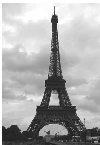
Classic: The Eiffel Tower.

6 LOOK FOR LAST-MINUTE DEALS. The important point to remember here is not to limit your search to one place. If your job makes it hard for you to plan vacations in advance, sign up for last-minute deal alerts from an airline that flies out of an airport nearby. But don't stop there: Check the last-minute-deal pages on the major travel sites, www.expedia.com , www.orbitz.com and www.travelocity.com . Then surf on over to www.shermans-travel.com and sign up for the weekly newsletter put out by its editors, who scour the Web for best deals. One of the "Hot Weekly Deals" listed when I checked was a $299 round trip to Paris, Nice or Rome. Also, try registering at www.lastminute-travel.com , named "Best of the Web" by Travel & Leisure and Forbes mag-