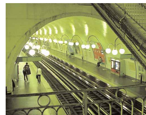
The Metro: Riding the rails in Paris.

11 LOOK FOR MOVEABLE BEDS. Another great way to get around in Europe is to take sleeper trains; this way you combine the cost of a hotel room with the cost of travel.